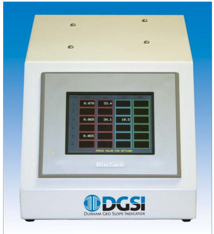
EZ-DAQ device showing, in this photograph, live data for three tests and six sensors. Data from up to eight sensors may be acquired and displayed simultaneously using the EZ-DAQ.

These connections supply the common 10 V dc excitation required by most of today's sensors. Along with the excitation, the connections also handle the sensor return signals. The flexibility designed into the EZ-DAQ System allows for the return signals to be configured in mV, V, or mA, and a multitude of ranges.