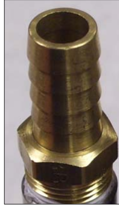
Fluid Discharge Hose Barb 1/2 in I.D. Buna-N Hose

Warning: All tubing or hoses attached to the pump must be secured with an appropriately sized hose clamp.