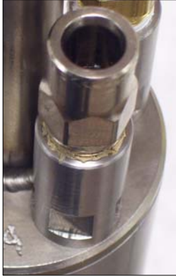
Air Inlet Push-To-Connect 1/4 in O.D. Nylon Tubing