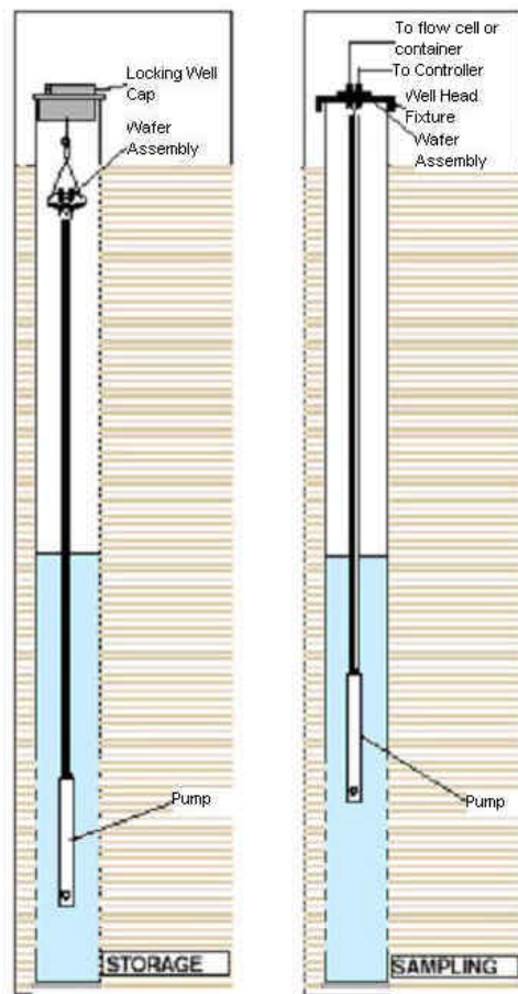
Suggested Installation of a MBP pump with Locking Cap Assembly and Well Head Fixture

The pump and tubing assembly should be removed from the poly bag and gently lowered into the well in a single operation to minimize the possibility of introducing contaminants into the well. Slip the tubing, just below the wafer assembly, through the slot in the Well Head Fixture and then place the Fixture over the top of the casing. Connect the tube from the Controller output to the “A”, air fitting on the top of the Wafer Assembly and the tube to the flow cell or sample container to the “W” fitting.