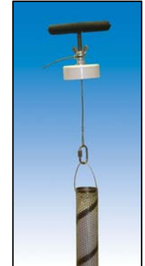
For reference only