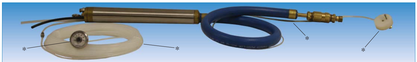
F.A.P. Plus ZW (TR-51640). The F.A.P. Plus (TR-516) is similar to the above, but does not come with the ZW option and PPS gauge (items marked with *).