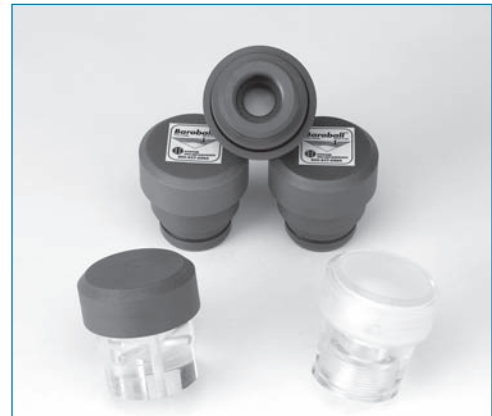
BaroBall™, Standard and Inverted

The BaroBall control valve allows natural soil gas to flow out of an underground well, while restricting air flow from the surface into the well.